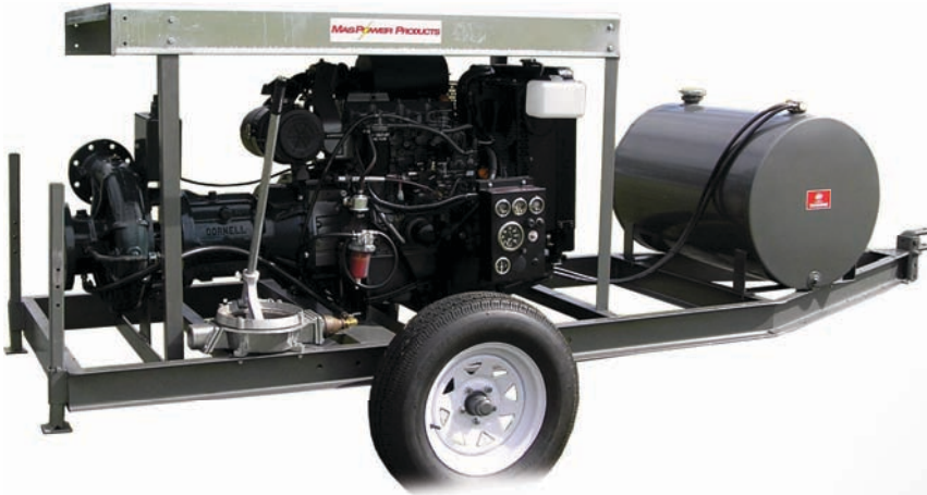
Trailer mounted unit